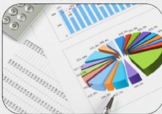
Accounting & Bookkeeping