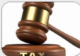
Corporate & Personal Tax