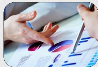
GST Registration & Filing