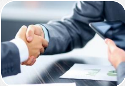
Company Limited By Guarantee

A separate legal entity, separate and distinct from the individuals who are involved in it and enjoys the same rights that a normal private limited company has.