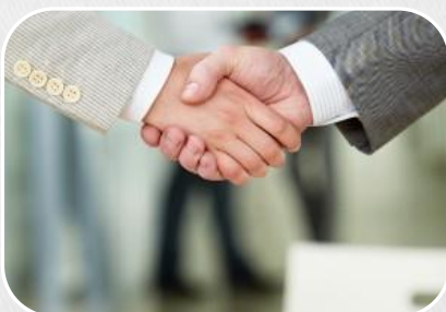
Association or Societies

A separate legal entity, separate and distinct from the individuals who are involved in it and enjoys the same rights that a normal private limited company has.